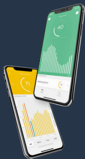
Kaiterra app for monitoring

Use the Kaiterra Dashboard to monitor and manage your devices in one portal, and use the Kaiterra app to stay on top of your air even on the go.